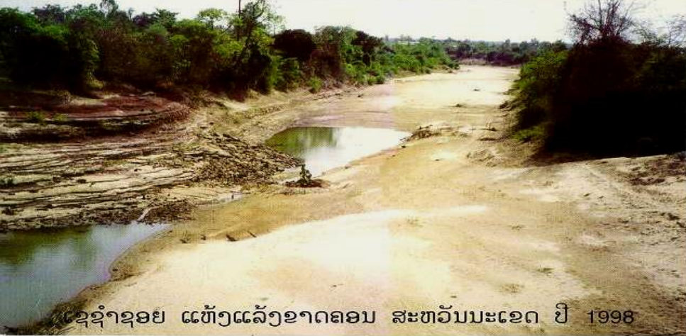
ເຊຊໍາຊອຍ ແຫ້ງແລ້ງຂາດຄອມ ສະຫວັນນະເຂດ ປີ 1998