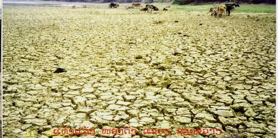
ແຫ້ງແລ້ງ ພາຍຸຕົງ ແຂວງ ອຸດຸນສອນ