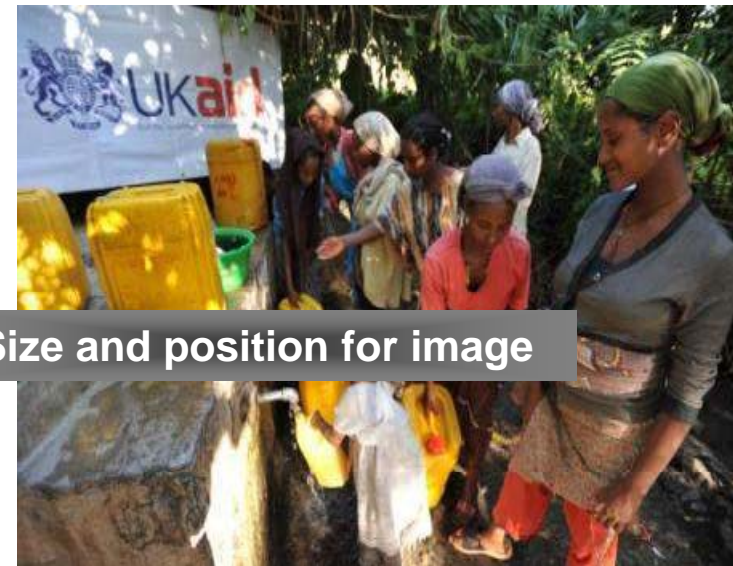
Size and position for image